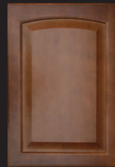
Raised Panel Arch Top