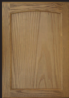
Flat Panel Arch Top