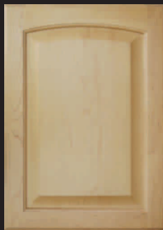
Raised Panel Arch Top